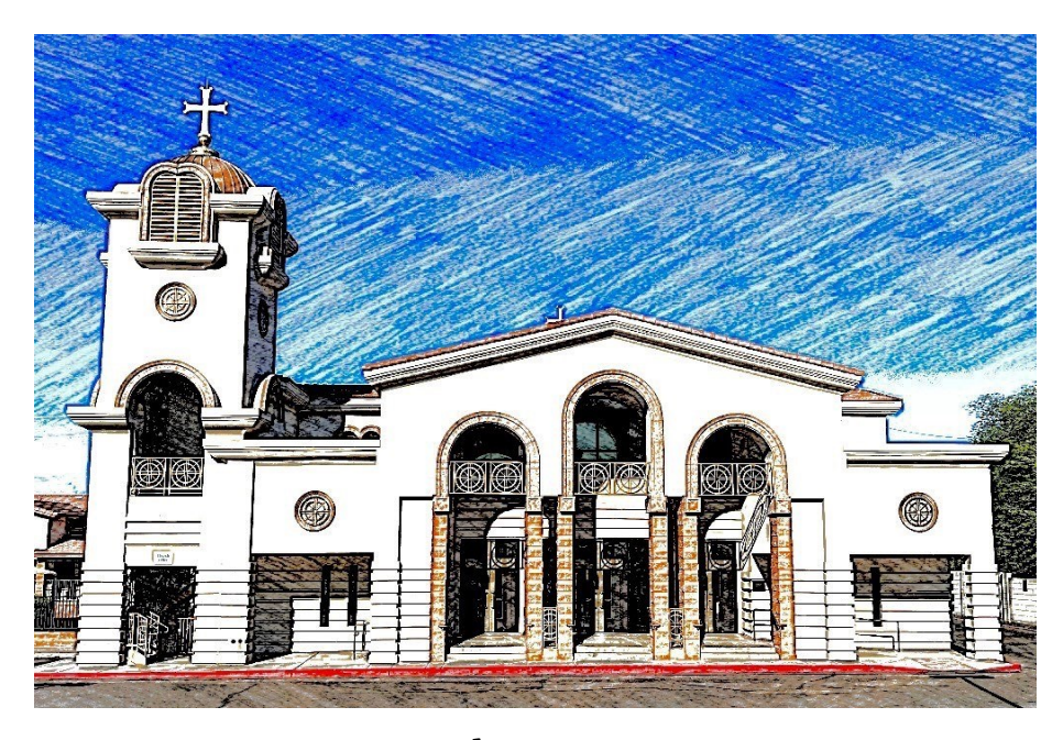
October 9, 2022 2nd Sunday of Luke