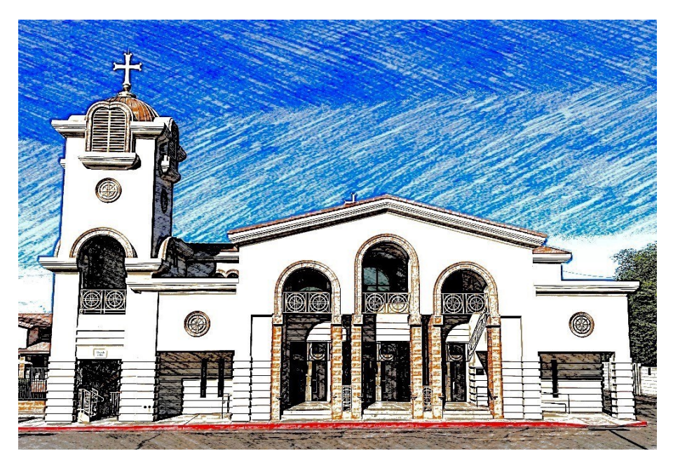
August 27th, 2023 12th Sunday of Matthew